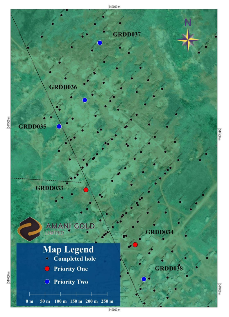
Figure 2. Map of central Kebigada gold deposit, showing the location of planned diamond core drillhole locations (Priority One holes in RED)

To this aim additional drilling has been planned, which will comprise a further 4 core holes, each 500m in length (Figure 2).