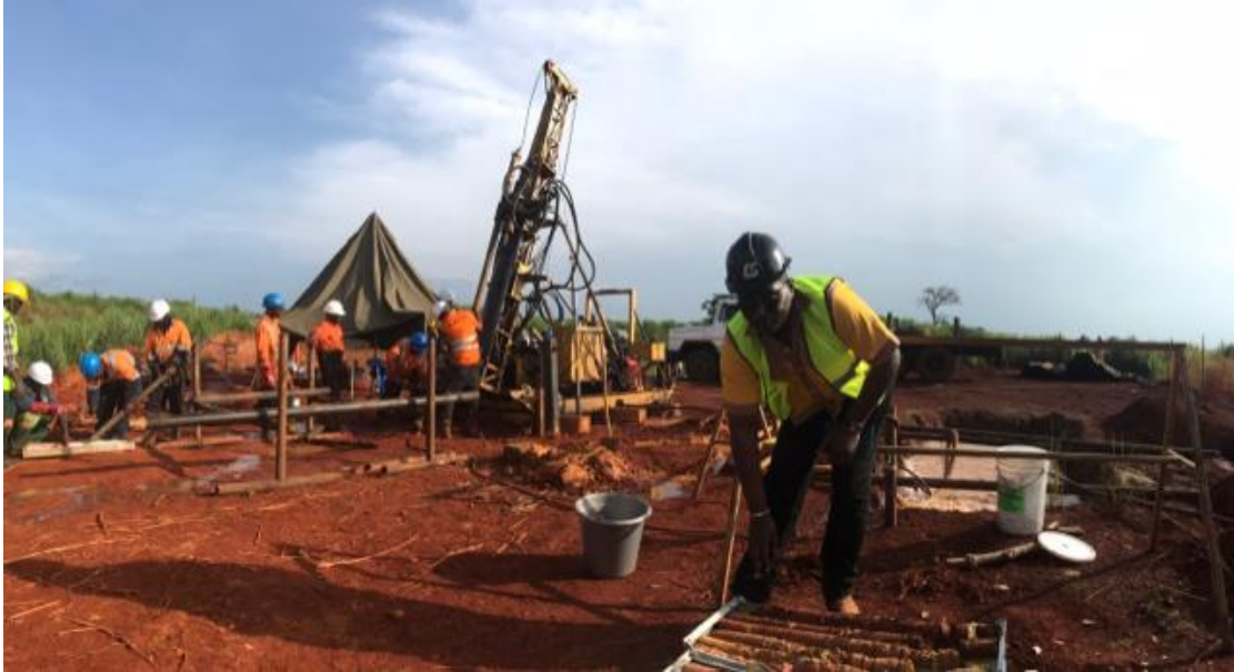
Photograph 1. Diamond core drill rig in operation at GRDD033