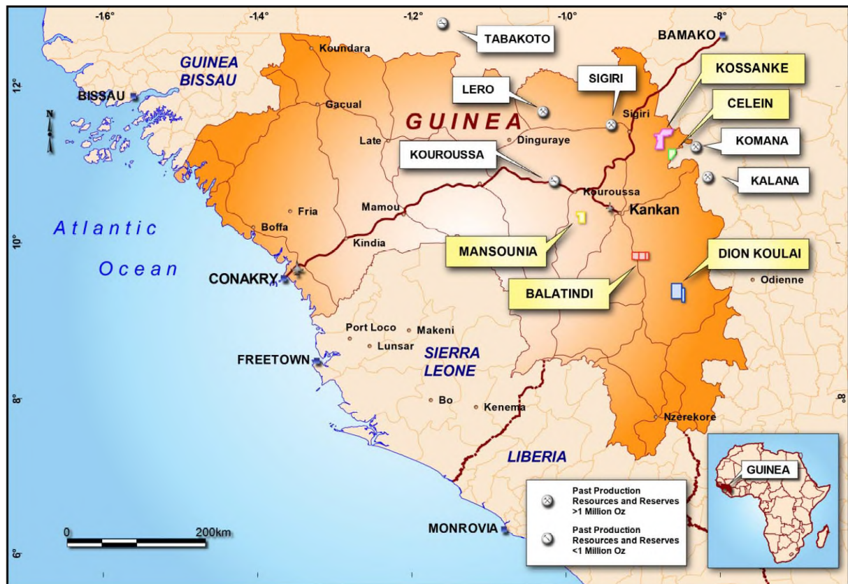
Figure 2: MGD location showing other projects and deposits in the region